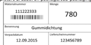
Sample picture 2: Label on package/sub-packaging/ SLC