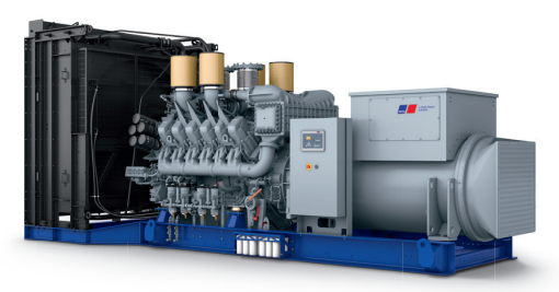
Optional equipment and finishing shown. Standard may vary.

380V – 11 kV/50 Hz/data center continuous power/ NEA (ORDE) optimized/12V4000G24F/water charge air cooling